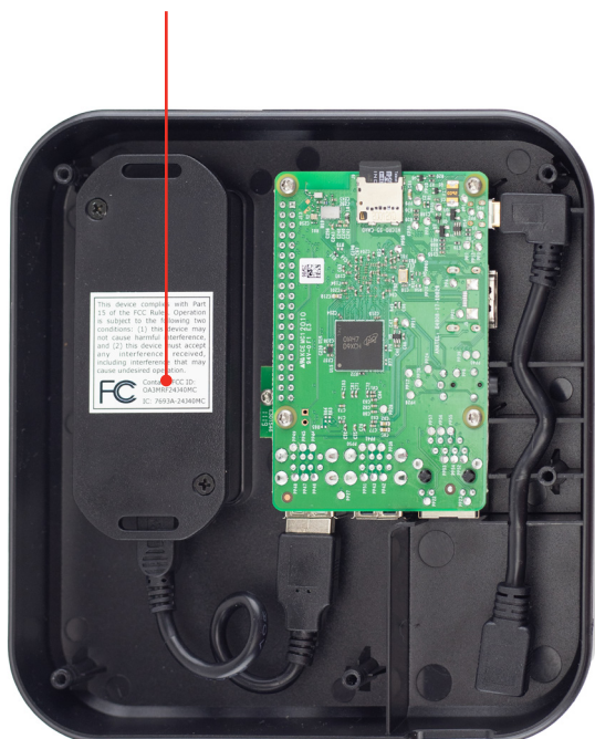
1a. Wireless Transceiver